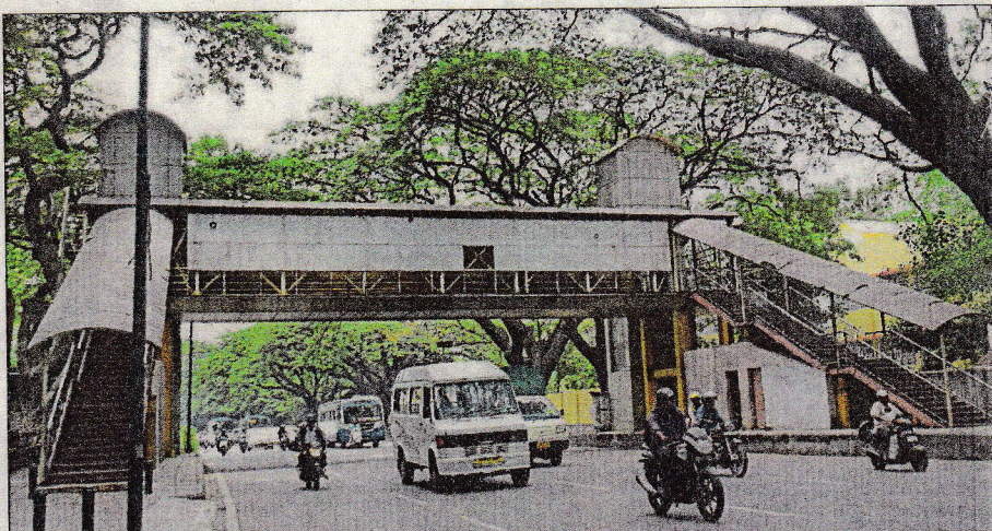
The skywalk on KG Road, which is equipped with an elevator.

According to a top official who was part of the meeting, the devices will not only help